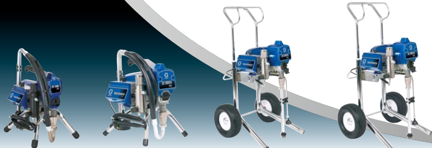
ST Max 395